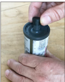
Insert the cap