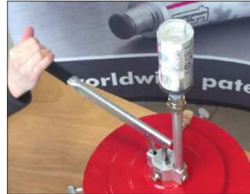
Fit the simalube onto the supply fitting and pump grease until it reaches the upper mark. ⚠ Do NOT overfill!