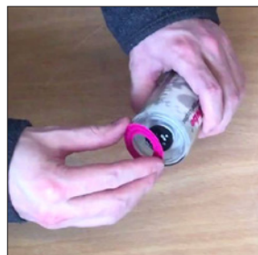
Stick on magenta ring