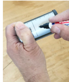
Mark lubricator with grease type