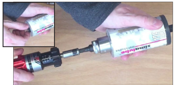
Screw in gas generator and tighten to 1.5-2.0 Nm