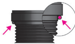
Check O-ring position