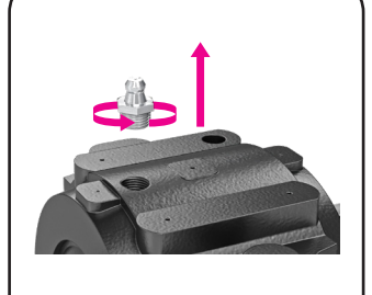
Remove grease nipple