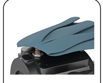
Clean lubrication point