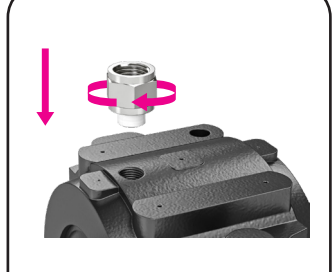
Screw in reducing nipple (Seal thread with sealing tape or other sealant)