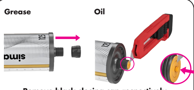
Remove black closing cap respectively cut off yellow closing plug