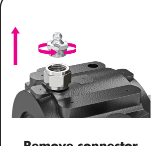
Remove connector nipple