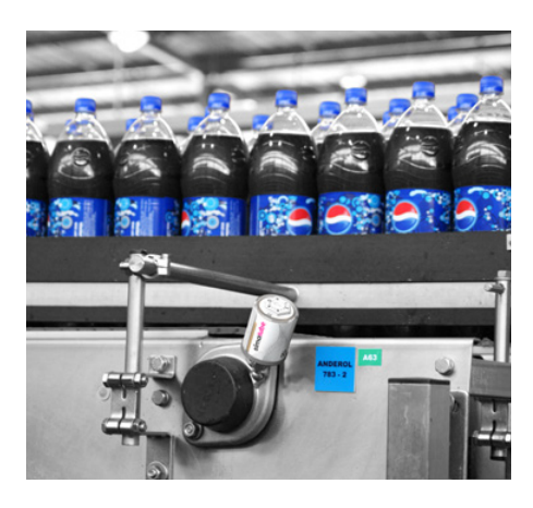
Lubrication of a flange bearing on a filling machine for soft drinks.