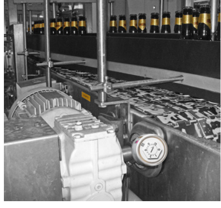
Lubrication of a transport belt with a simalube lubricator.