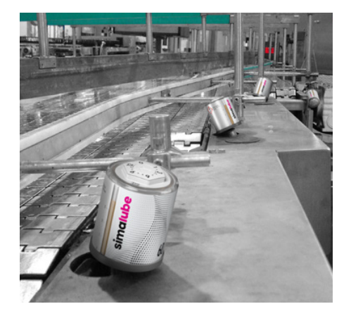
A filling line is equipped with several simalube lubricators.

«simalube lubricates continuously, extends the lifespan of the production machines and sinks maintenance costs»