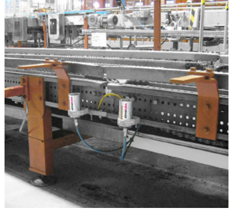
Two simalube lubricators with tube extensions lubricate a transfer chain in a brewery.