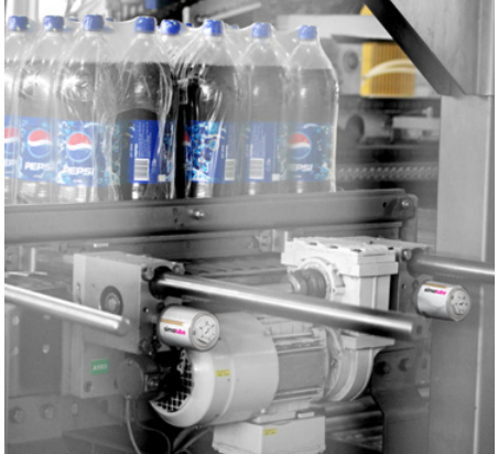
The bearing on the gear box is lubricated with two 60 ml simalube lubricators.