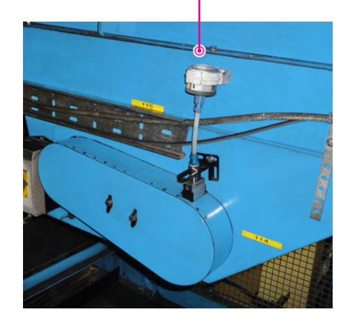
The baggage conveyor belt in an airport is automatically lubricated from the exterior, meaning there is no need for the time-consuming removal of the chain cover.