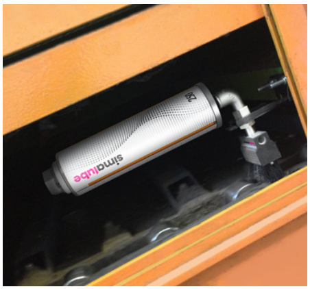
The conveyor belt chain in a recycling factory is automatically lubricated and cleaned with simalube and brush.