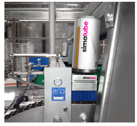
simalube and brush lubricate the chain in a brewery.