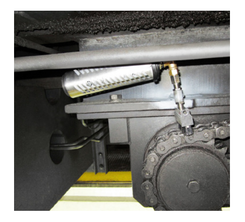
The 250 ml simalube lubricator lubricates the chain drive of a railway crane. The dispenser is also protected by a protective cover.

«Save time and improve reliability with simalube chain lubrication»