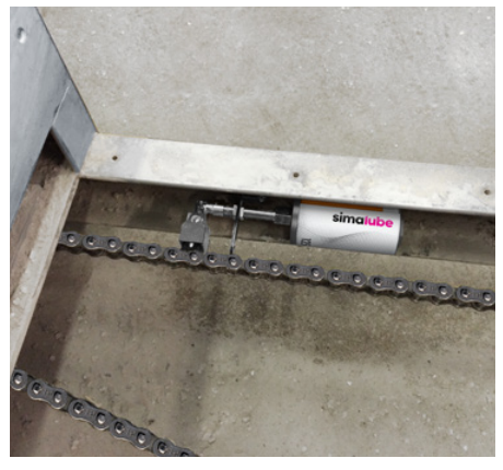
If there are space constraints, simalube can also be installed at an angle.