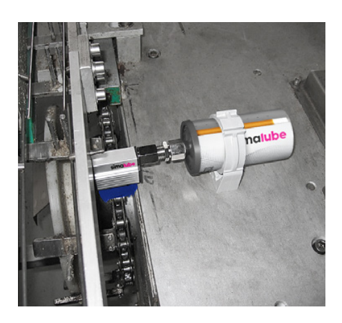
In the food industry, the special blue brush is used with food oil.