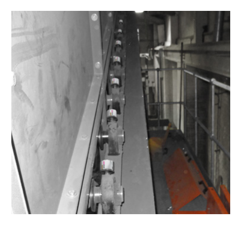
Dozens of 30 ml simalube lubricators provide the bearings of a conveyor belt with the necessary lubricant.