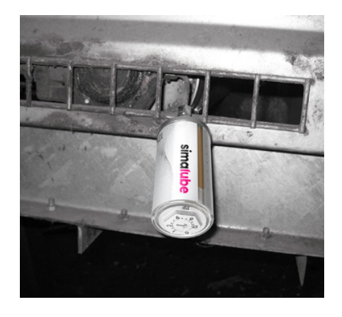
simalube lubricates bearings on a conveyor belt.