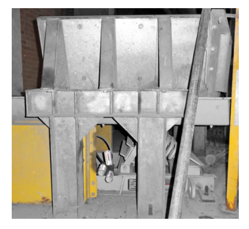
A vibrating conveyor lubricated by several 125 ml simalube lubricators.