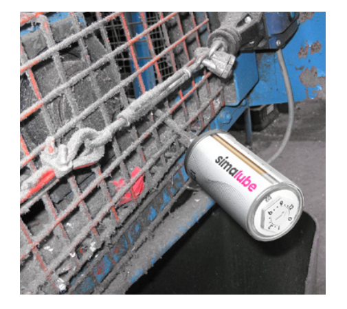
The externally installed simalube prevents dirt from entering the lubrication point.

«simalube increases employee safety in factories»