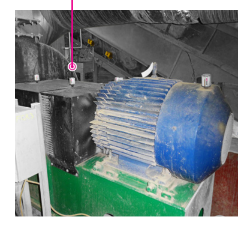
The FGR ventilator is lubricated by simalube 60 ml.