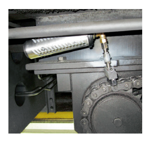
The simulube 250 ml lubricant dispenser lubricates the drive chain of a rail crane. A protective cover protects the dispenser.