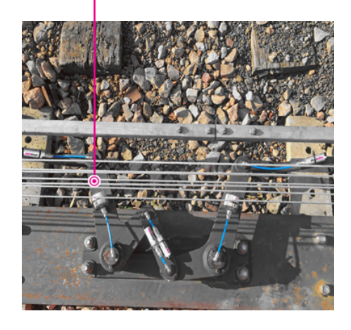
Two 30 ml simalube lubricators and four 15 ml simalube dispensers continuously lubricate the compensator of a signalling system.