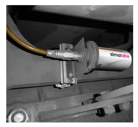
The 125\,\mathrm{ml} dispenser is installed on the chassis of a low floor tram. The lubricant is directed through a hose to the lubrication point.