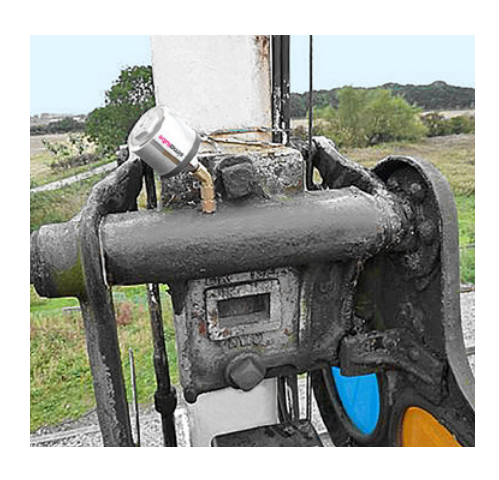
The plain bearing of a railway signal is automatically and continuously lubricated by a 30 ml simalube lubricator.