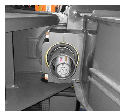
The coupling of two railway cars is lubricated with a simalube 125 ml lubricator.