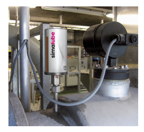
Lubricating bearings: the lubricant is transported to the bearings via a short pipe.