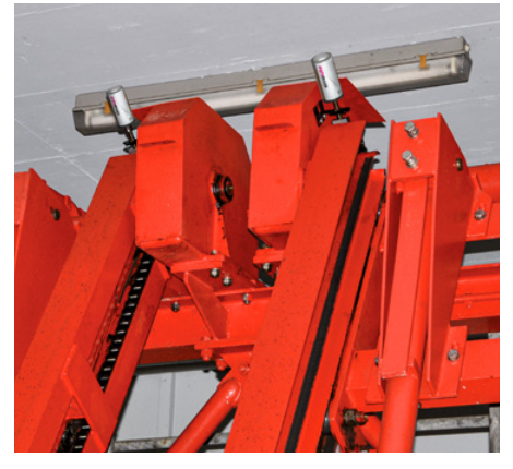
Chain lubrication with simalube on a bar screen equipped with brushes.