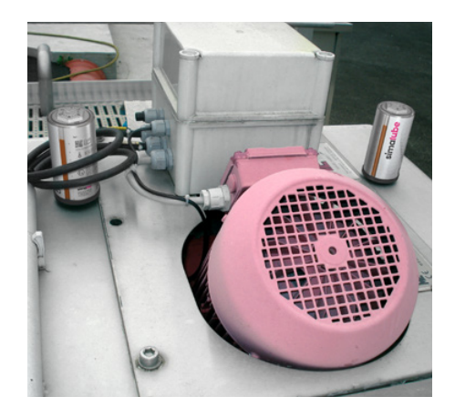
Lubricating conveyor chains with oil. The lubricators are attached to the outside of the housing. The oil is transported to the chain via a tube.