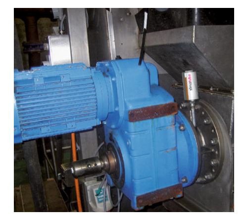
Lubrication of the main shaft of a wash press.

«simalube supports all working processes at wastewater and sewage treatment plants»