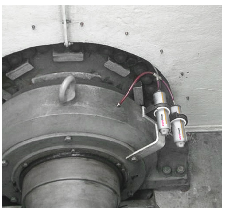
Two simalube 250 ml lubricators lubricate the main bearing of a wind turbine.