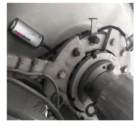
With the practical simalube accessories, it is possible to easily equip each lubrication point with a simalube dispenser.