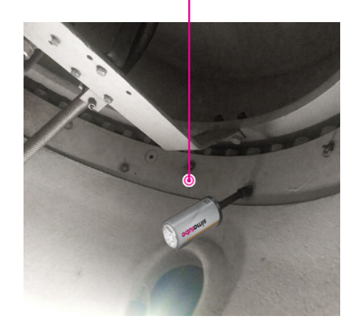
Automatic lubrication using the simalube 125 ml on a rotor blade bearing.