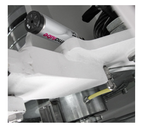
Even in tight spaces, the smallest lubricator lubricates reliably and precisely.