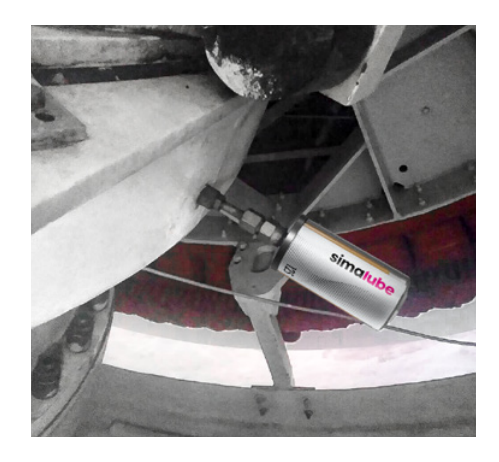
In this wind turbine, the simalube lubricator is set with a dispensing time of six months.