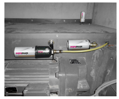
The lubricant is fed to the lubrication point via a long line. A mounting bracket with two magnets fixes the simulube IMPULSE connect to the machine.