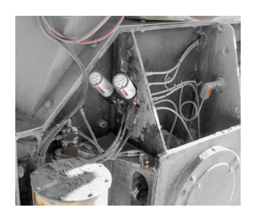
In a quarry, two simalube IMPULSE connect pressure boosters effortlessly overcome the counter-pressure of two bearings. These were also included in the simalube lubrication plan «Lubechart» via the simatec app.