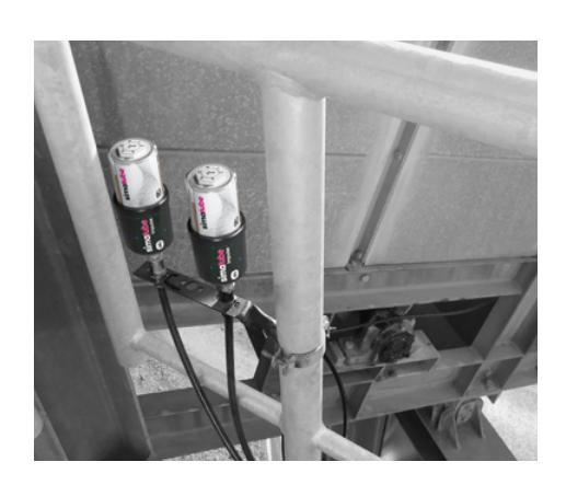
The lubrication points are at a dangerous height. They can be controlled conveniently from the ground with the simatec app.