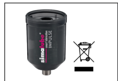
Dispose according 2002/96/EG (WEEE)