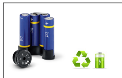
Dispose the battery pack in battery recy-